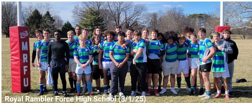
Royal Rambler Force High School (3/1/25)